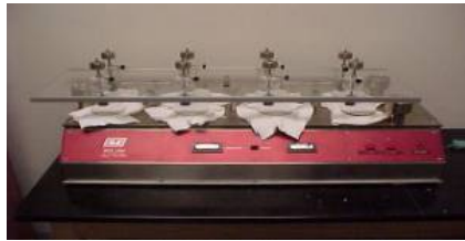
Figure One: ILE SCR 800 8-Position Sock Tester

6.5 Toothbrush — A medium bristle toothbrush is suggested for use of removing pills during abrasion testing.